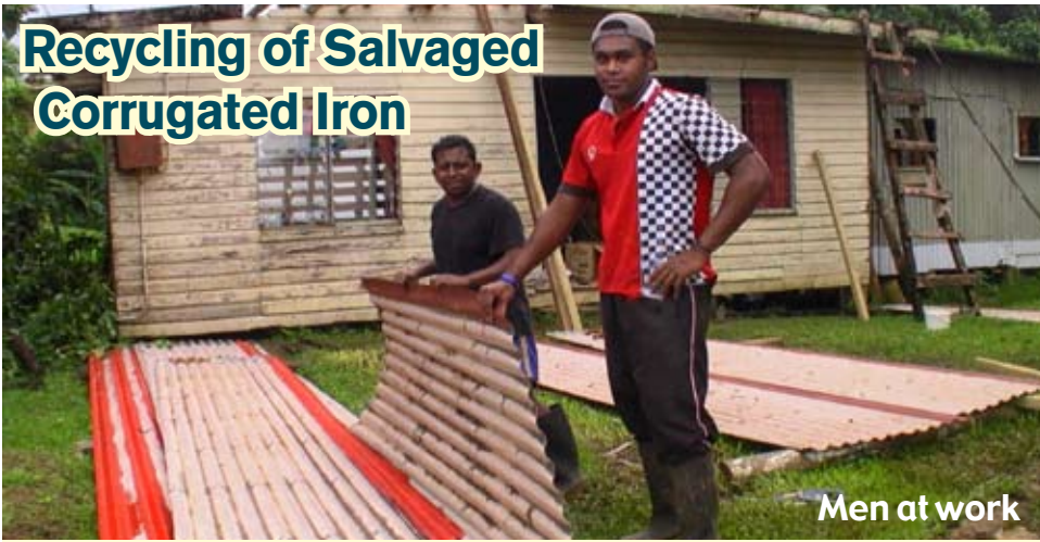
Men at work

The Westpac Banking Corporation has recently completed carrying out the refurbishment of their main branch building situated at 1 Thompson Street, Suva City.